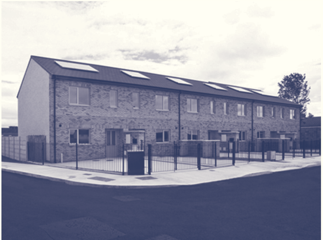
Figure 1. Finglas Rapid Build exterior

The developments' modular construction proved central in resident expectations and perceptions of life in Rapid Build housing prior to moving. Some residents had concerns regarding the structural soundness and quality of the buildings, with such fears often connected to historical connotations of post-war prefabricated ('prefab') housing in Ireland, and assumptions that they would be living in containers or mobile homes: