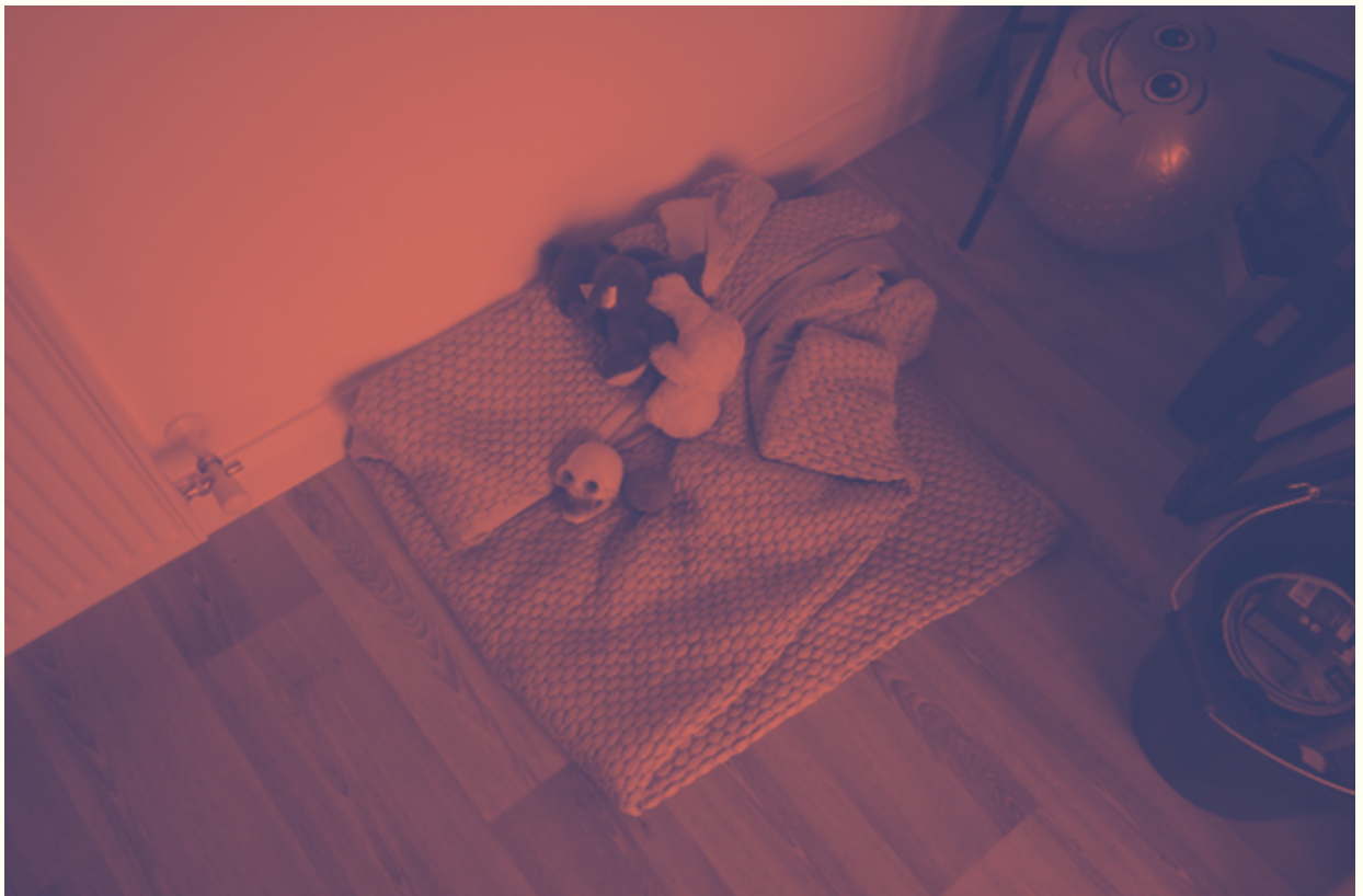
Figure 3. Mary's sofa throw-turned-dog bed

"Although there was another bed in the Travelodge, we tried to make it homely and we put a throw over it, and that's one of the throws there actually, we let the dog have it now. Because it's those things you don't want to see anymore, if you know what I mean."